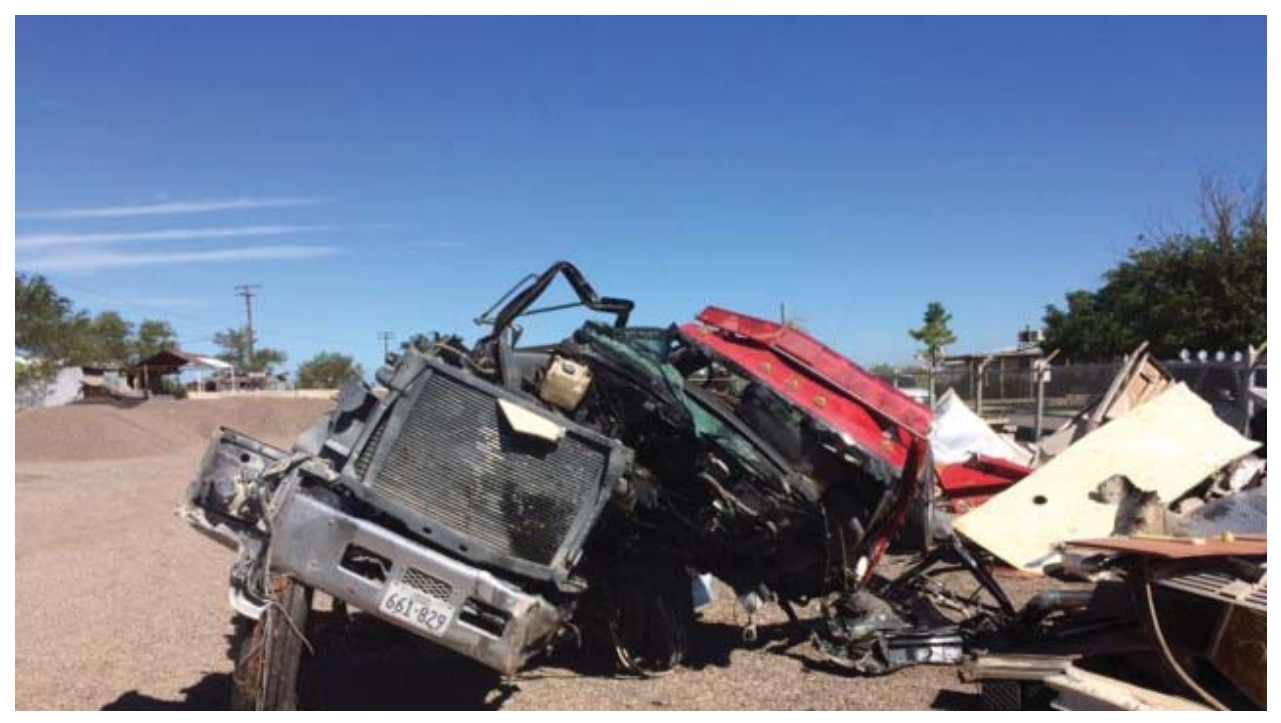
Photograph of Wink Engine One ( Taken at county yard )

Texas A&M Engineering Extension Service (TEEX) EVOC teaches that during normal traffic and weather conditions the recommended following distance is four seconds. For each additional factor, (darkness, weather, visibility, heavy traffic, etc.) one additional second should be added. Operators should focus 12 seconds ahead in their direction of travel. When weather conditions or darkness reduce visibility the driver must reduce speed and increase awareness. There is no designated "safe" speed. Operators must adjust their driving according to conditions and vehicle limitations.