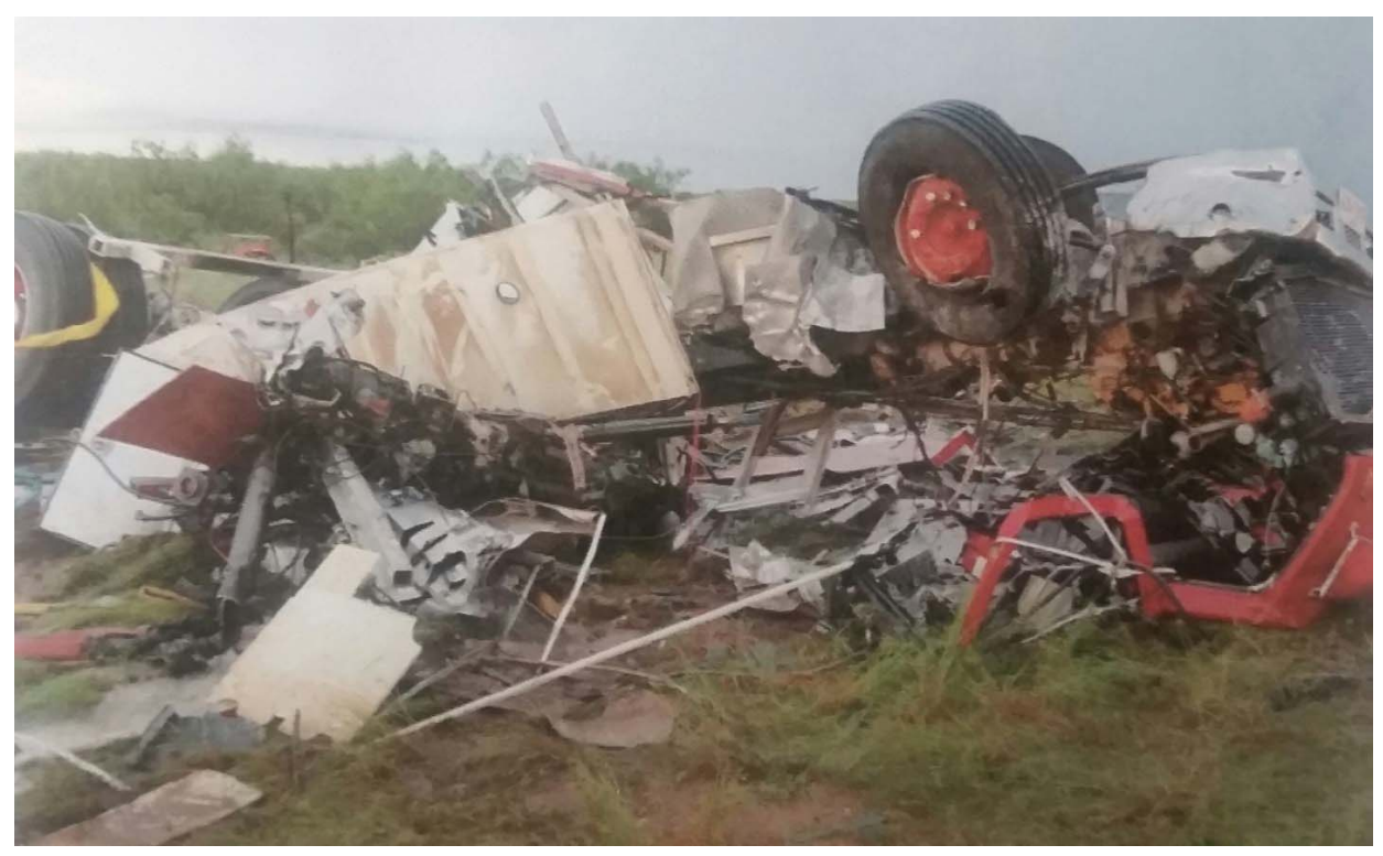
Photograph of Wink Engine One ( Taken at the scene )