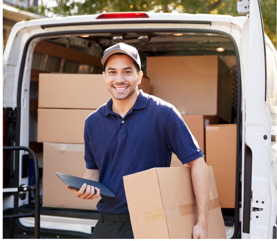
Texas Department of Insurance, Division of Workers' Compensation www.txsafetyatwork.com HS18-05B (12-19)

It is important to know which local, state, and federal regulations govern the company's vehicles and drivers. Information on <u>applicable laws</u> is available at DWC's Occupational Driving Safety Resources website.