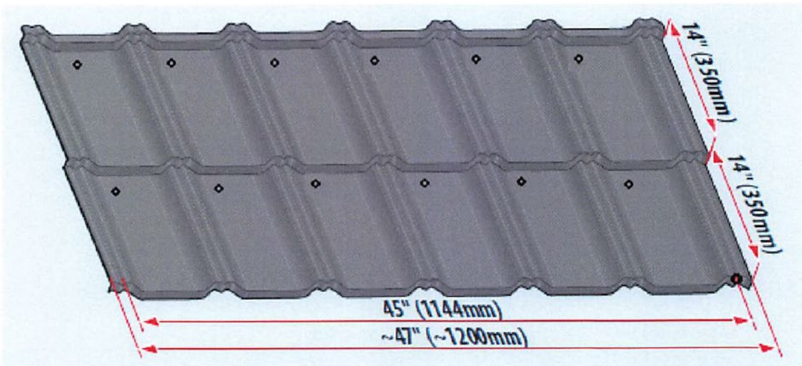
Tremblant panel 12 per panel fastening layout