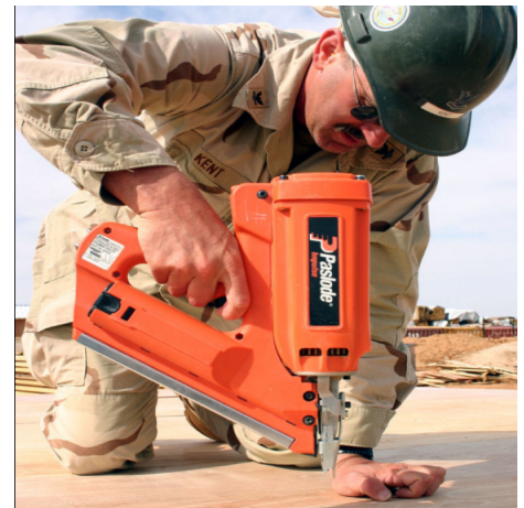
Some cordless nail guns use a fuel and electric igniter to fire.