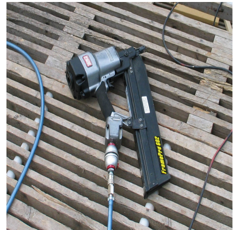
Pneumatic nail guns require air hoses to fire.

Always carefully review the owner's manual with all operators. Have someone familiar with the tool demonstrate safe operating procedures. Then, have each employee take a turn using the tool and watch how each one performs.