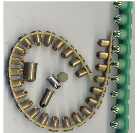
Cartridges used in powder actuated nail guns.