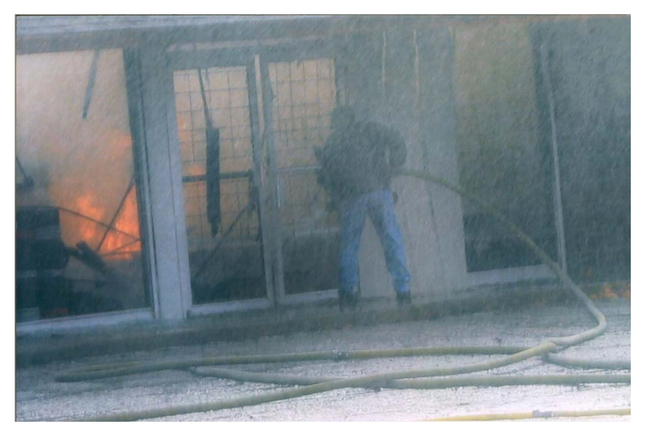
Figure 7. Chief Weger performing firefighting operations prior to the collapse.