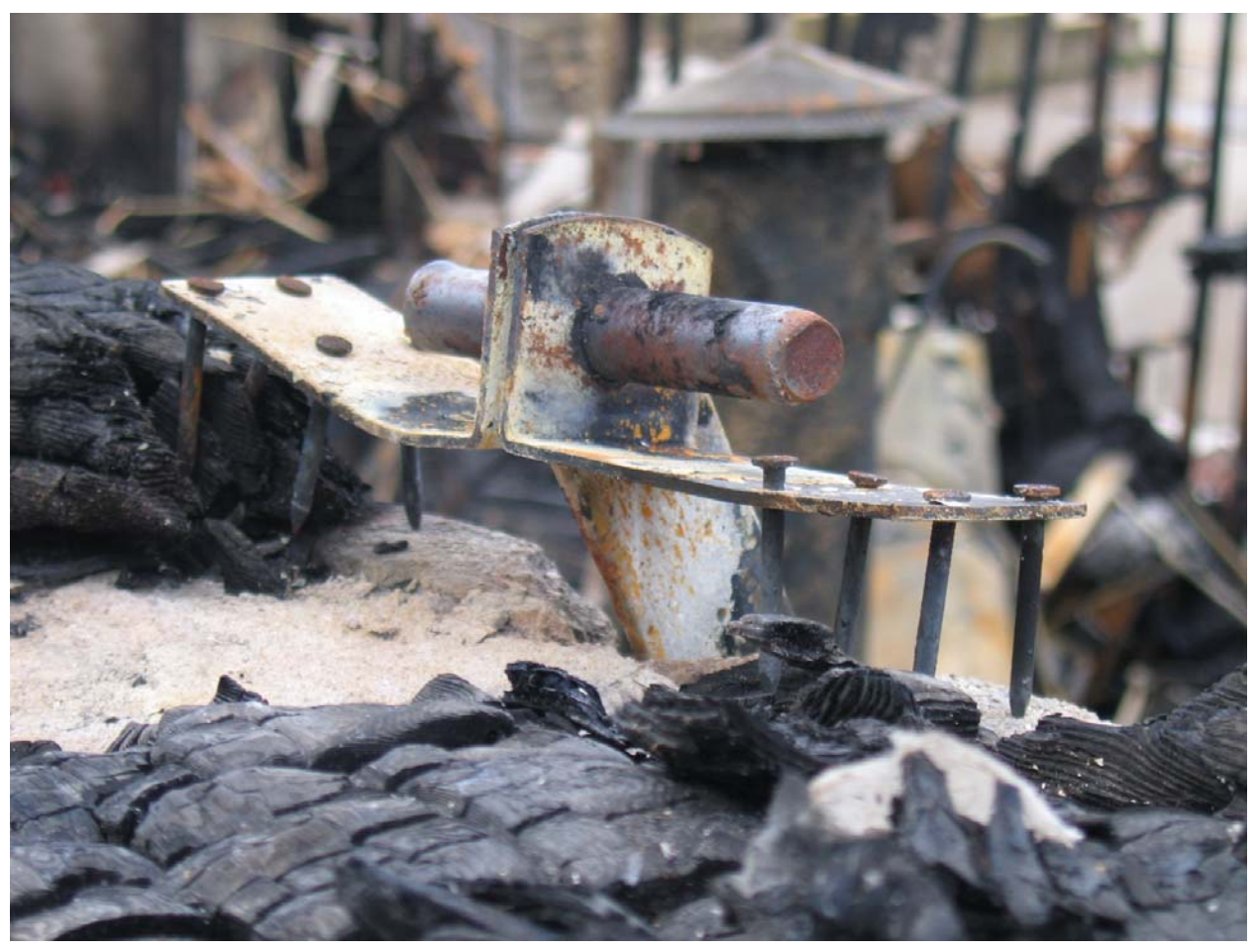
Figure 3. Roof truss attachment to east wall

The structure had a gutter system that was attached to the roof and the top of the masonry block wall on the east (rear) side of the structure. The gutter, flashing, and truss anchors were all attached to the top of the masonry wall.