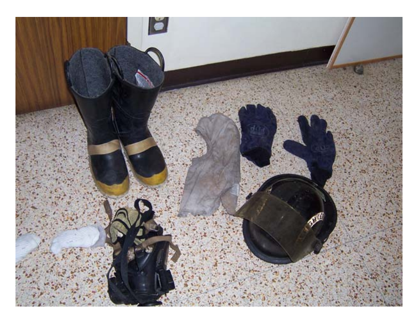
Figure 11. Firefighter Townsend's PPE