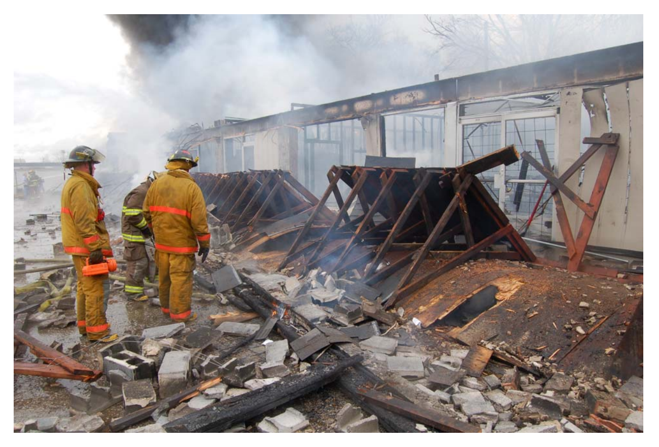
Figure 10. South view of collapse

Units from Sherman Fire Department and Pottsboro Fire Department along with the Denison fire fighters continued to work the fire. Command communicated a "loss stop" report to dispatch at 1024 hours. Units were on the scene most of the rest of the day conducting overhaul activities.