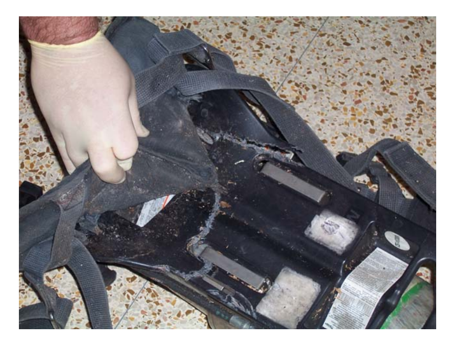
Figure 12. Photograph of the SCBA frame damage illustrating the cracked bracket

Inspection of the Personnel Alert Safety System (PASS) revealed that the device was 'On' and in a good working condition.