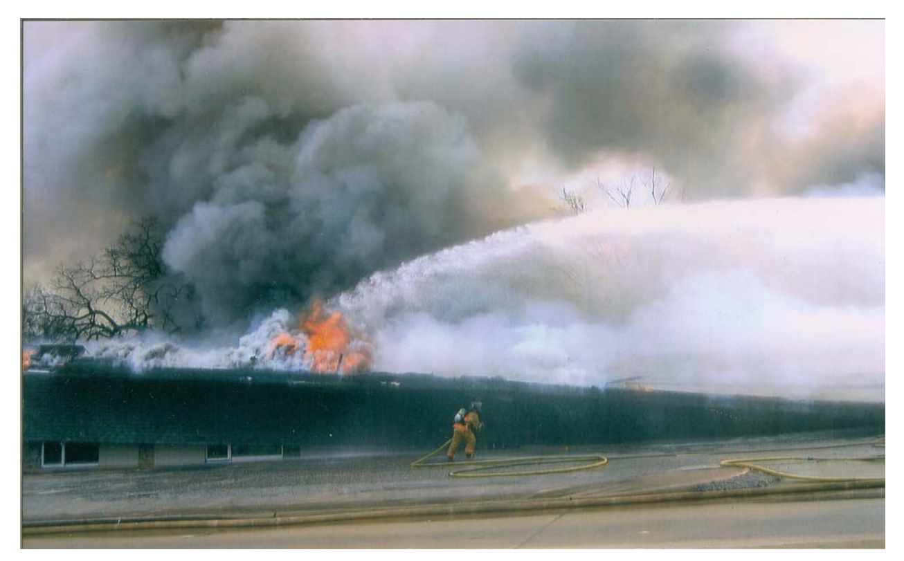
Figure 8. At the moment of collapse Firefighter Mullican starts toward Weger and Townsend's position.