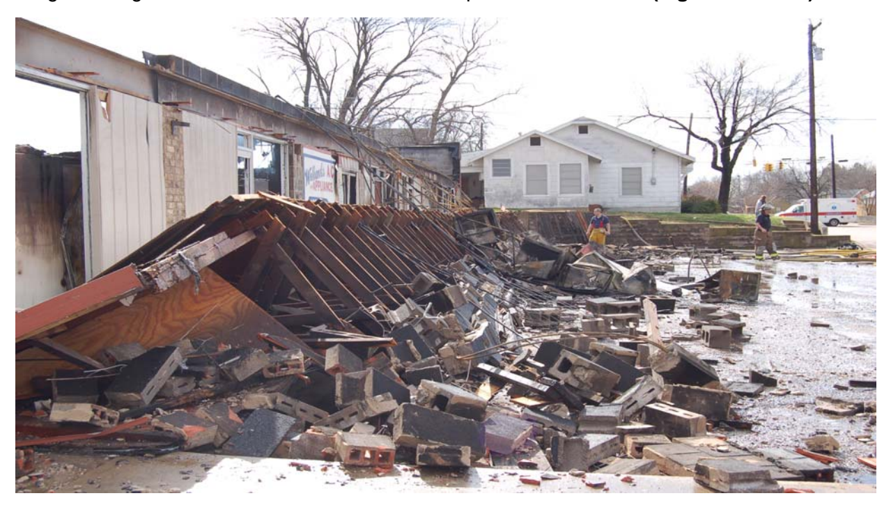
Figure 1. Collapsed awning

The front of the structure faced west toward South Crocket Avenue. The front wall was a combination steel I-beam, supported by steel pipe columns, masonry block, wood siding, aluminum frame windows, and glass doors. An awning over the sidewalk along the length of the front extended from the wall approximately 6 feet, 8 inches wide and 6 feet, 8 inches high, forming an open, triangular space. It was constructed of two-inch by six-inch (2 x 6) wood joists and two-inch by four-inch (2 x 4) wood framing. It was nailed to a 2 x 4 wood ledge that was bolted to the lower edge of the I-beam. The back of the awning assembly was attached to the concrete block wall above the I-beam with one-half inch diameter by 13 inch long steel bolts ( \frac{1}{2} " x 13"). The roof of the awning was curved with one-inch-thick plywood under composition shingle roofing and measured nine feet from the top to the front fascia. (Figures 1 and 2)