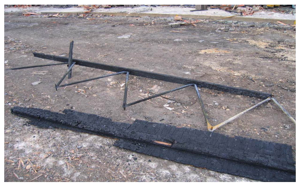
Figure 4. Remains of truss

The building had a dropped ceiling, without fire separation between compartments to prevent heat and smoke spread. The exposed roof system was a pin-connected open web truss of tubular webbing and solid steel pins secured in unprotected two-inch by four-inch (2 \times 4) wood chords. There were no indications that fire retardant or insulation was used on any of the exposed wood surfaces of the truss system or the roof decking. (See Figure 4.)